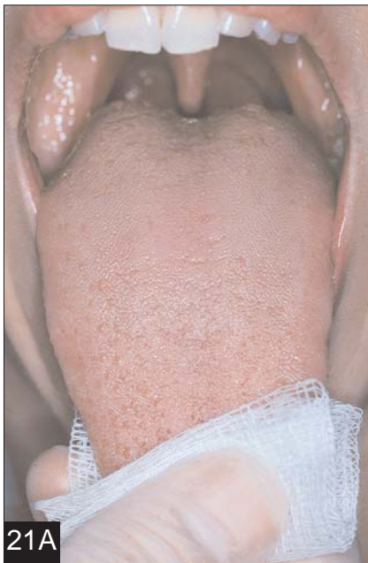
Figure 21 Examination of the oral cavity. The tip of the tongue should be grasped with a piece of gauze (A) and pulled out to each side (B) to allow visualization of the posterior lateral borders and ventral surface of the tongue. This is the most common site for intraoral cancer.