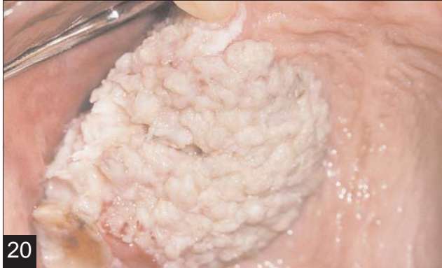
Figure 20 Verrucous carcinoma. White, exophytic, warty mass of the maxillary alveolar ridge. (Courtesy of Neville BW, Damm DD, Allen CM, et al. Oral & Maxillofacial Pathology , ed 2, Philadelphia, WB Saunders, 2002.)