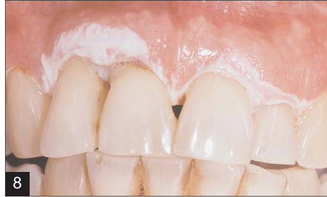
Figure 3 Frictional ridge keratosis. This rough, white change of the edentulous area of the alveolar ridge represents a frictional hyperkeratosis because this area now receives more irritation during mastication. This should not be mistaken for true leukoplakia, and biopsy is not indicated.